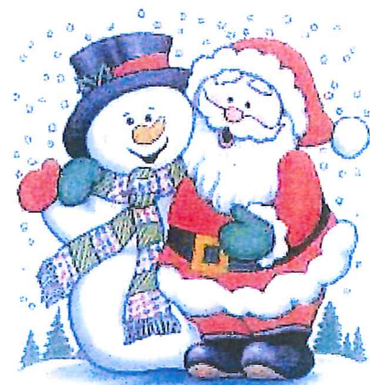
Christmas joy warms the heart

"Thank you" goes out to all of you who were able to prepare the delicious dishes for our Thanksgiving Family Potluck Luncheon. This luncheon was a true culinary experience of delicious cultural dishes. We were so stuffed at the end of the luncheon that the children slept very well.